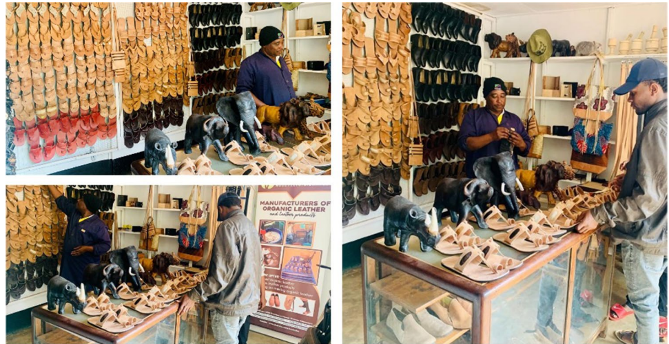
Fig. 2 KIWANGO Leather cluster showroom at Usangi Village

Government agencies, including COSTECH, Small Industry Development Organization (SIDO), and Mwanga (Usangi) District Local Government, were also involved in the process. The operationalization of the guideline resulted in the generation of a case, which is presented in this study.