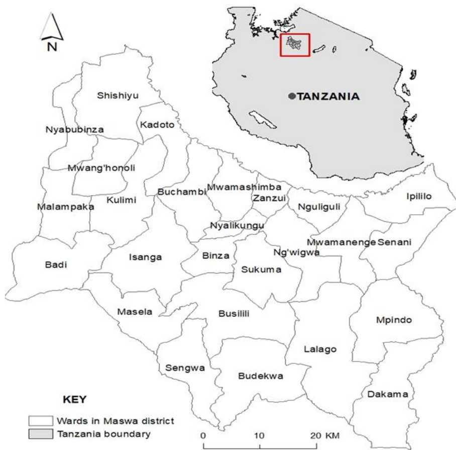
Figure 1: the map of Tanzania (top left corner) and Maswa district showing the wards of the study area